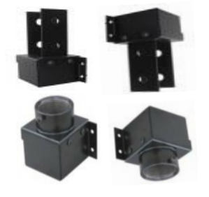
Use the Unistrut® Mounting Back Plate to attach the Camera Bracket to other Unistrut® fittings