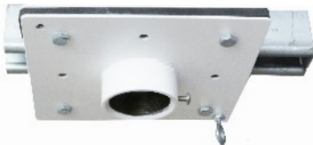
Ceiling Plate attached to Unistrut