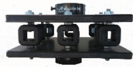
NB-UIM-96 Measures 6½ x 6½

All our Anti-Vibration Devices use a proprietary Visco-Elastic Polymer that flows like a liquid under load. Combining this fast reacting high energy absorption with a near faultless long Memory, guarantees it will outlast any other material, including all one dimensional materials like Rubber or Springs that are often used in an attempt to cure vibration. Rubber in particular has a short life and Springs will also lose their efficiency over a similar short time.