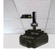
The NB-UIM Anti-Vibration Adaptor shown installed 3" above a projector's Mount.

All Ship completely assembled for instant attachment to the Projector's 1 1/2" Dia Pole