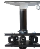
Ceiling Plate Comes with NB-UIM-W-96 & with NB-UIM-96 & Safety Cable