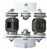
NB-UIM-15 to NB-UIM-60 Measure 4" x 4"