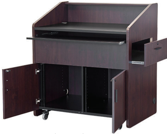
Flat Top Shown

Top rear removable, intended to easily be mounted in a wedge position or as flat large work surface, that can support monitors laptops and room control systems.