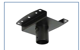
Ceiling Plate (Included)