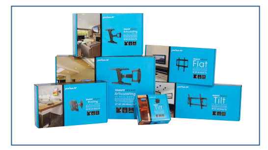
Comes in color packaging with included installation hardware and easy to follow instructions.