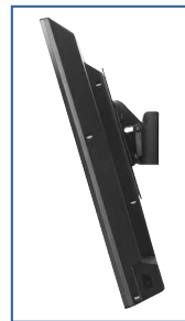
15°/-5° of tilt for versatile viewing angles.

Please visit peerless-av.com/en-us/patents for patent information.