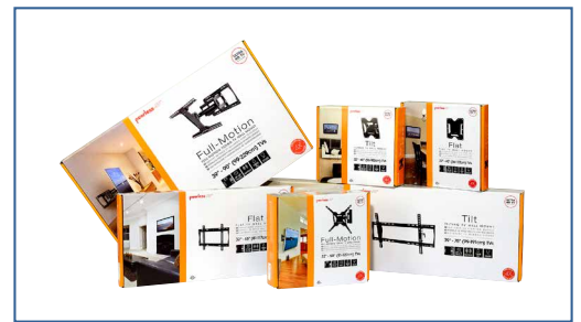
Comes in color packaging with included installation hardware and easy to follow instructions.