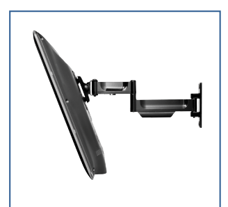
Swivel, tilt, extend or retract the display for the perfect viewing angle.

Please visit peerless-av.com/en-us/patents for patent information.