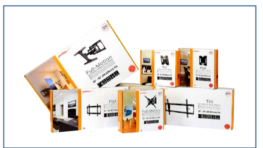
Comes in color packaging with included installation hardware and easy to follow instructions.