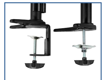
Clamp-on and grommet mount option

CLAMP-ON & GROMMET BASE For wood or composite surfaces up to 3" (76mm) thick