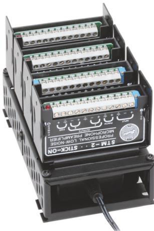
FP-PSB1A Power Supply Bracket with ST-PBR4