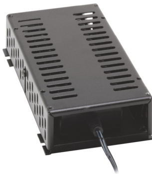
FP-PSB1A Power Supply Bracket with desktop supply

The FP-PSB1A mounts to any flat surface or in an RDL Flat-Pak™ series rack mount panel (FP-RRR or FP-RRRH). The design of the FP-PSB1A allows it to slide into the Flat-Pak rack mount track. Mounting the FP-PA20 power amplifier (or other RDL modules using available adapter) together with the power supply conserves rack space and produces a convenient and professional installation.