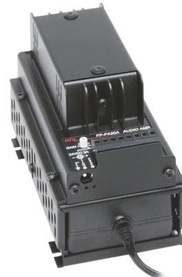
FP-PSB1A with power supply and FP-PA20 audio amplifier mounted