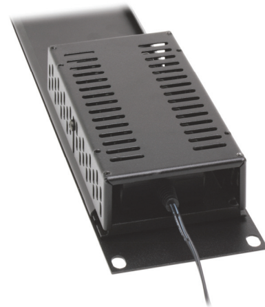
FP-PSB1A mounted in FP-RRR