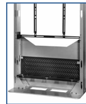
Component Tray & Shelf