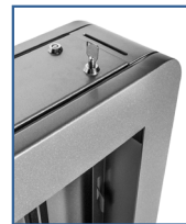
Keyed-Alike Cam Locks