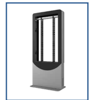
Custom Colors Available