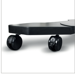
Braked castors for mobility