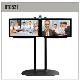
Mobile Twin Screen VC Stand with Camera Shelf for screens up to 42"