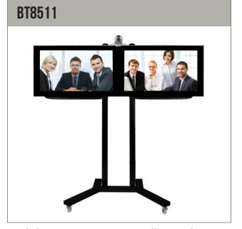
Mobile Twin Screen VC Trolley with Camera Shelf for screens up to 42"