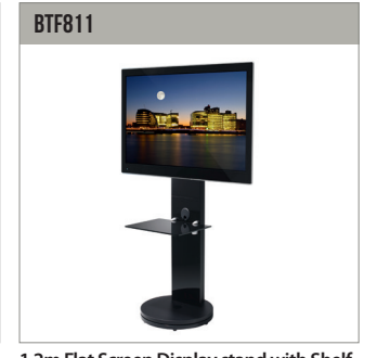
1.2m Flat Screen Display stand with Shelf designed for screens up to 46"