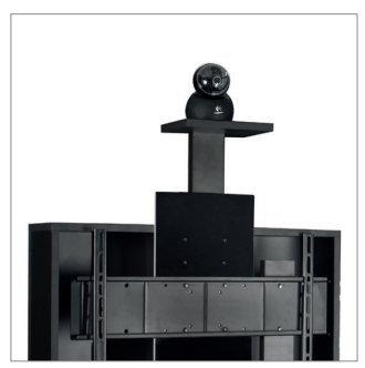
Includes optional video conferencing camera shelf