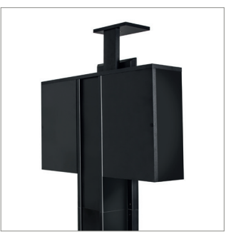
Stylish rear cover to protect video codec / AV player