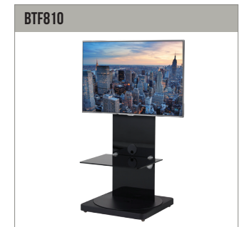
1m Flat Screen Display stand with Shelf designed for screens up to 60"