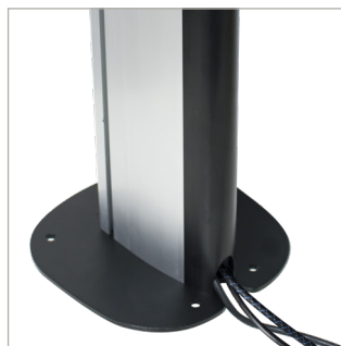
Small footprint base is ideal for shop windows and cable management covers hide untidy cables for a neat install