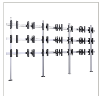
Use the online configurator to customise screen set-up