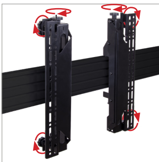
Tool-less micro-adjustment for seamless screen alignment

*Please note BT8372-3X3 is available in two packages: BT8372-3X3 is designed for screens from 46"-55" and BT8372-3X3-60 is designed for screens from 55"-60". BT8372-3X3-60 has a width of 3505mm