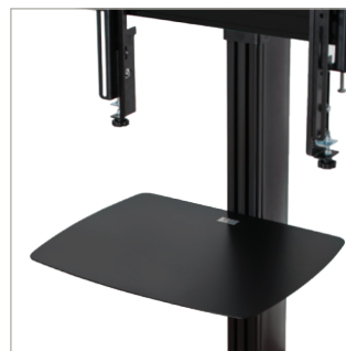
Fit System 2 compatible accessories such as shelves without using collars