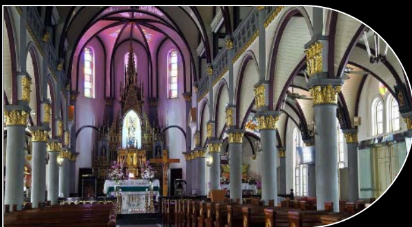
House of Worship