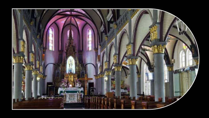
House of Worship