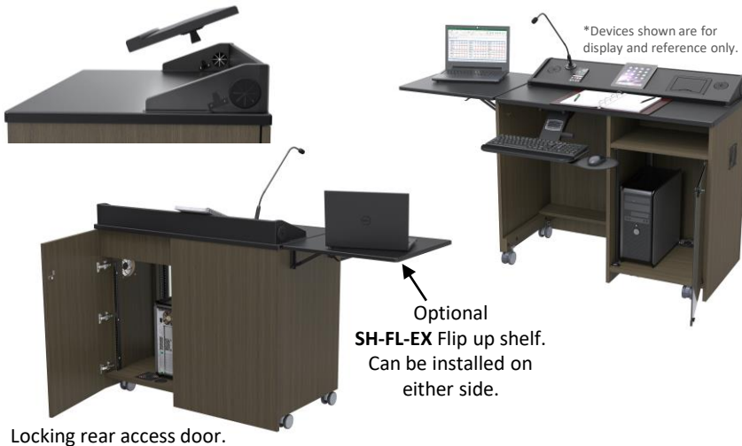
Optional SH-FL-EX Flip up shelf. Can be installed on either side.

Optional CNLEDU-PD Console with removable wedge panel can be easily mounted to configure different device installations.