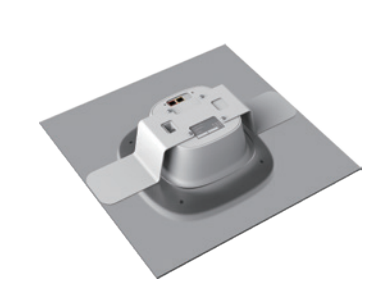
Ceiling mount (optional)