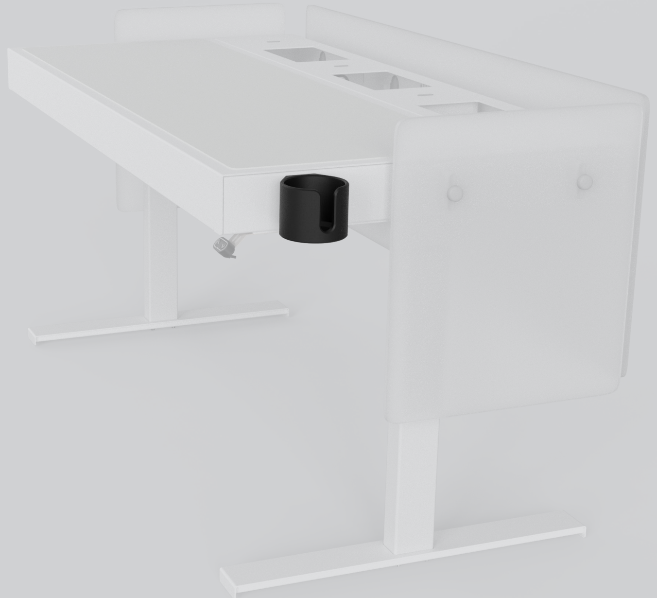
H926 Cup Holder for Heckler Lectern

Can be mounted to the left or right side of the lectern.