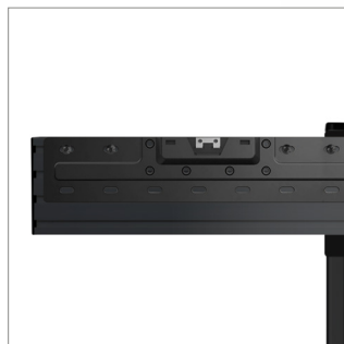
Included mounting brackets fasten securely to BT8390 Rails