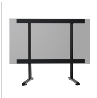
Designed and configured specifically for the Samsung 110" IAB Series All-in-One