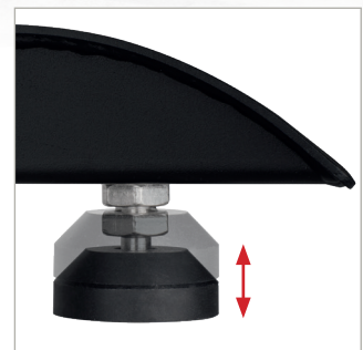
Adjustable levelling feet to accommodate uneven floor surfaces