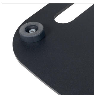
Non-marking rubber feet for increased stability