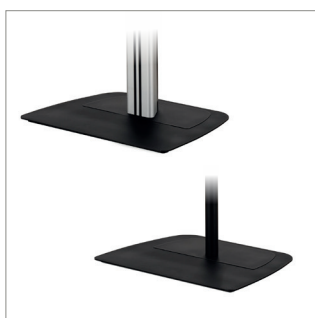
Designed for use with a single B-Tech Ø50mm floor stand pole or BT8381 vertical support column