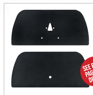
A choice of cover plates hide grab handles for a smart finish (sold separately)