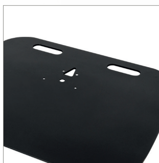
Grab handles allow for easy handling