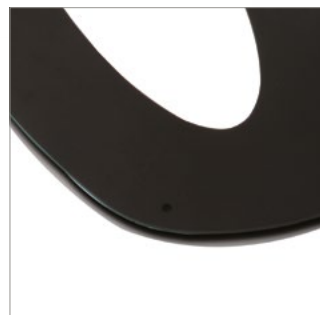
Can be used freestanding or bolted to the floor