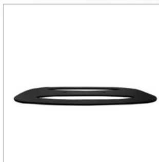
Heavy duty 6mm thick steel construction