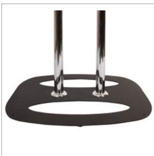
Floor base designed for use with B-Tech's Ø60mm poles (BT4005/BT4011/BT4015/ BT4020)