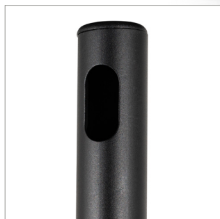
Integrated cable management and end cap for a tidy finish