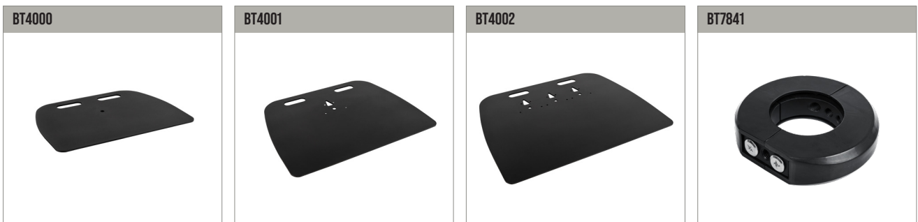
Small Floor Base for use with a single floor base pole to create freestanding solutions for small to medium screens