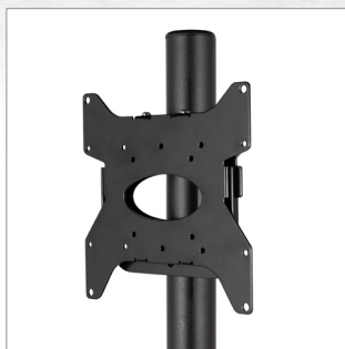
Fit B-Tech screen mounts to the pole using a BT7052 or a BT7841 collar