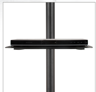
B-Tech AV shelves and accessories can also be fitted to the pole using BT7052 or a BT7841 collars