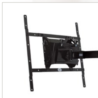
Use 2 sets of BT7540 to increase VESA mounting pattern to 400 x 400mm