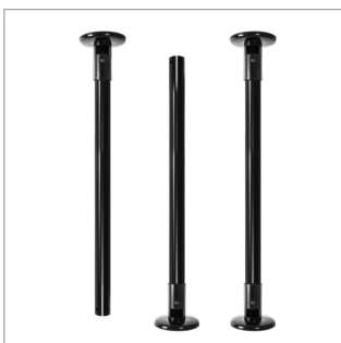
Can be mounted from floors, ceilings or both for more mounting flexibility