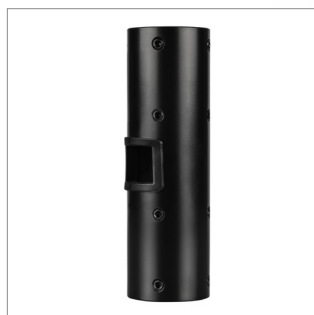
Poles can be linked together using BT7823 & BT7824 Pole Joiners