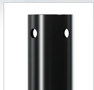
Features safety bolt holes at the top and bottom for secure installation