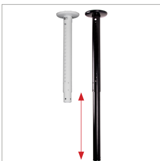
Adjustable drop in 25mm increments for the perfect height positioning with a maximum drop of 1m