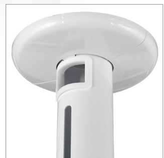
Includes cover plate and cable management for a neat and tidy installation