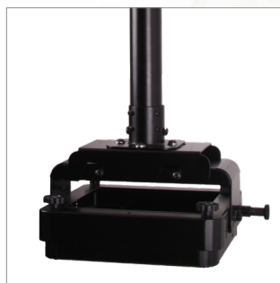
Compatible with a large range of B-Tech mounts, including projector and screen mounts