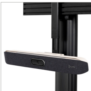
Use with BT8390-SA to mount above or below any screen mounted to a System X Rail.