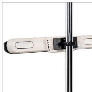
Videobars can also be pole-mounted when used alongside B-Tech Accessory Collars.