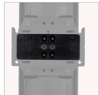
Mount to any Mode-AL Column via the Mode-AL Interface Plate.