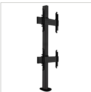
Must be used with System X mounting solutions using BT8380 vertical columns