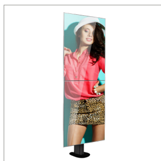
Can be used for single column installations in landscape or portrait format