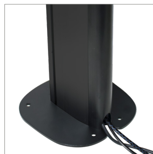
Integrated cable management for a neat and tidy installation