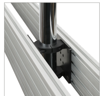
Suitable for back-to-back configurations (multiple brackets required)