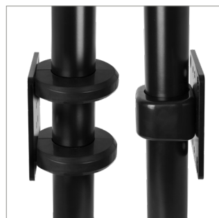
Countersunk fixing holes keep the install looking neat and tidy