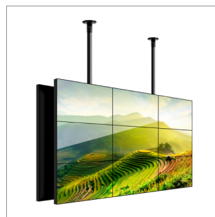
Heavy duty steel plate capable of supporting heavy loads