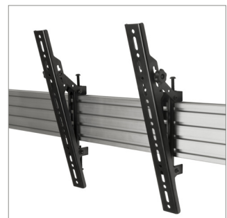
ideal for use with installations using tilting interface arms