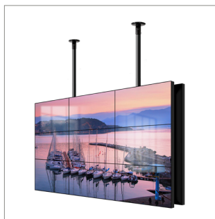
Can also be used for pole mounted video wall installations