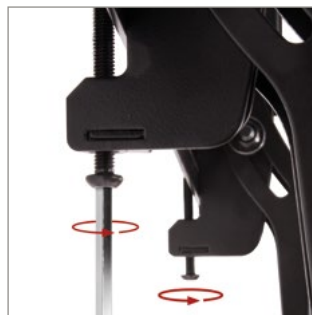
Security locking screws and Allen key provide a secure installation