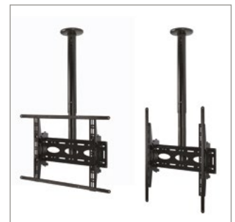
Can mount screen in a landscape or portrait orientation