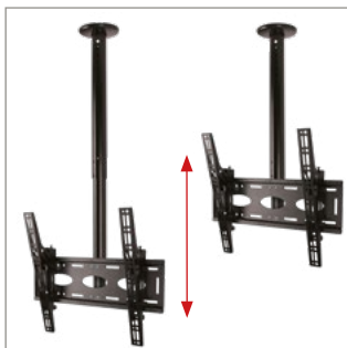
Quick and easy 'push button' height adjustment