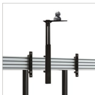
Includes VC shelf which can mount camera above or below the screens