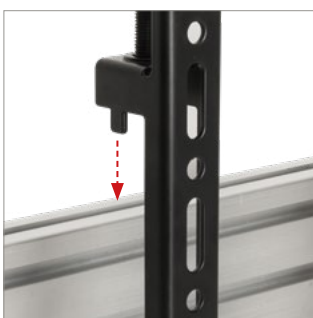
Simple 'hook-on' installation