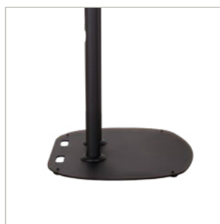
Can be displayed freestanding or bolted to the floor