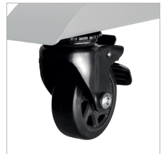
Includes non-marking 4"locking / braked castors