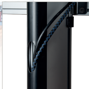
Integrated cable management for a tidy install