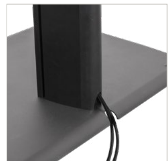
Integrated cable management for a neat and tidy installation