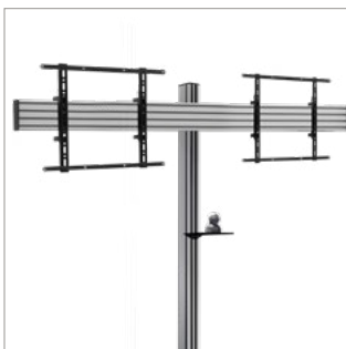
Maximum VESA fixing can be increased to 600mm using the included adapter arms