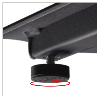
Supplied with adjustable levelling feet to accommodate uneven floor surfaces