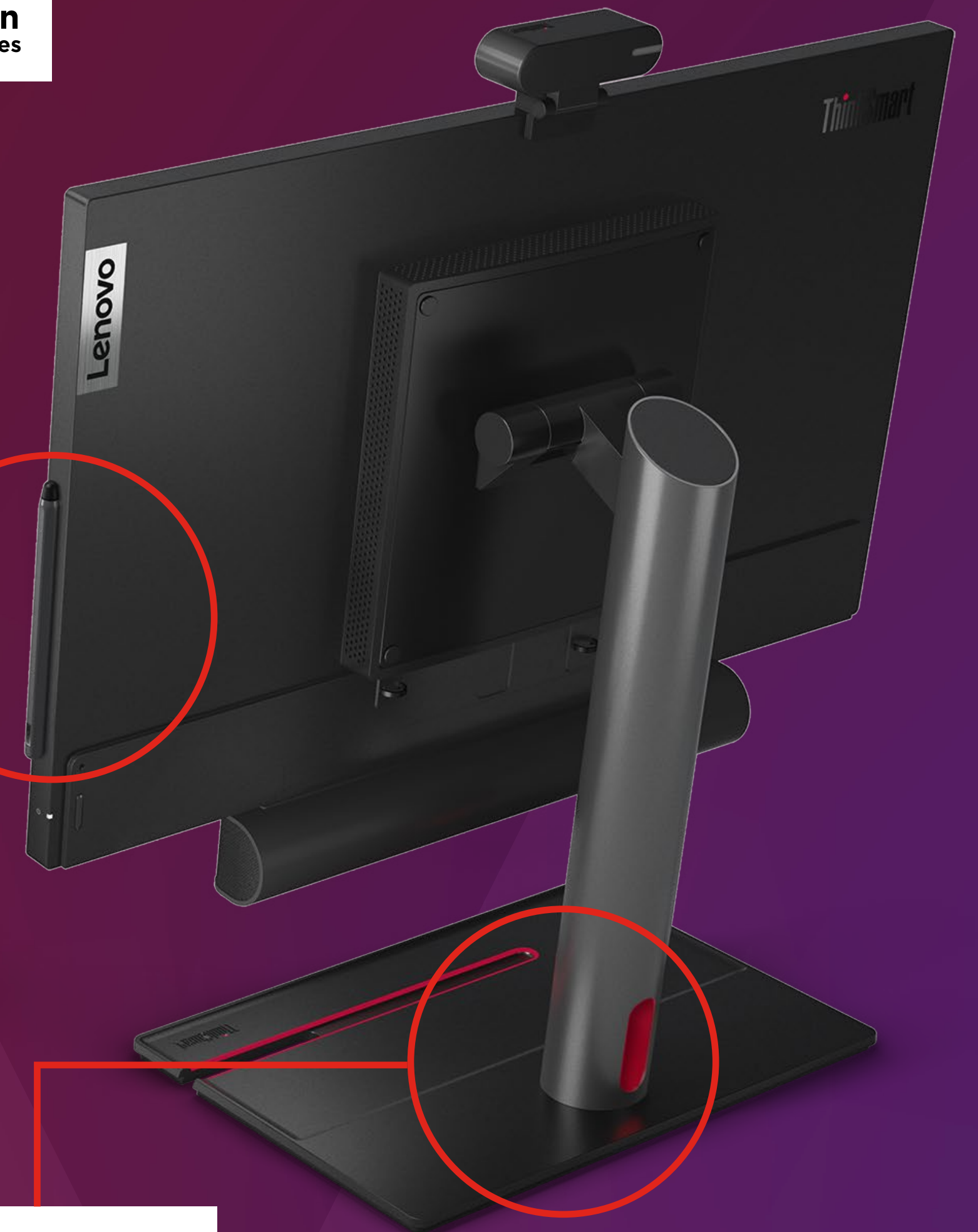
Adjustable stand Height | Tilt | Swivel