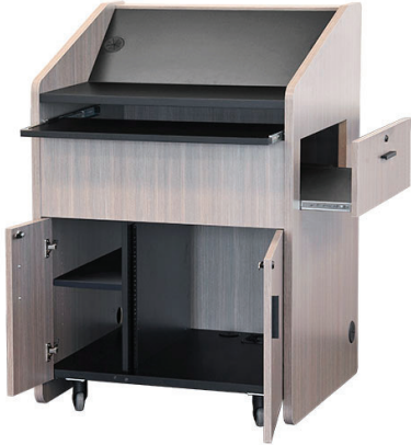
Console Top Shown

Top rear removable, intended to easily be mounted in a wedge position or as flat large work surface, that can support monitors laptops and room control systems.