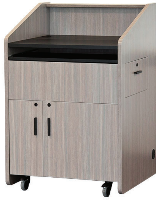
Flat Top Shown