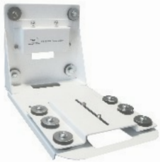
Wall Mount Bracket with Camera removed