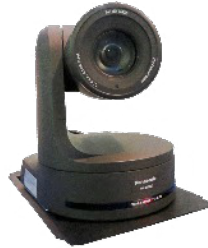
Panasonic Camera shown mounted on the Tripod Platform