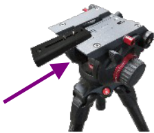
For illustration purposes, the platform has been removed to show how the Quick Release Plate slides on to the Tripod's Head and then locked into Place