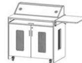
PD5107 Dual Rack Station 42.75"W x 30"D x 47"H