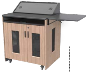
PD51 with folding shelf

Model: 5101TP-L, 5101TP-R, 5102TP Width: 58" Depth: 30" Height: 1" Finish: Black thermowrap laminate only.