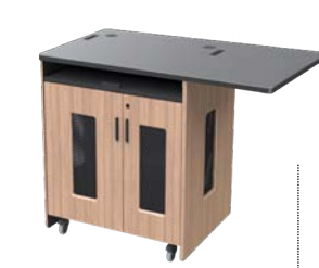
PD51 with 5101TP-R Top