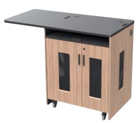
PD51 with 5101TP-L Top