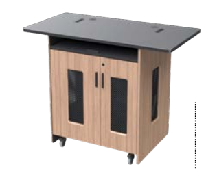
PD51 with 5102TP Top (Folding side shelf cannot be used along with 5102TP Top)