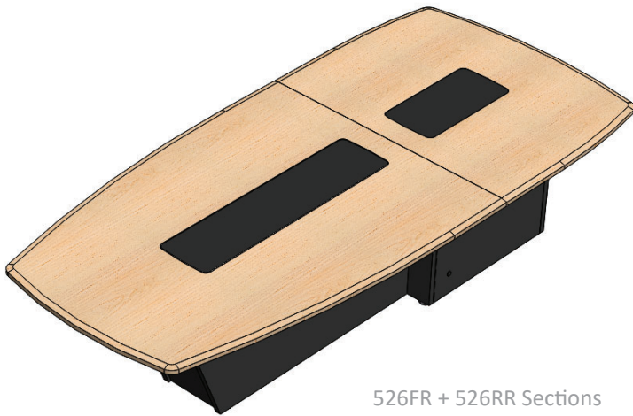
526FR + 526RR Sections