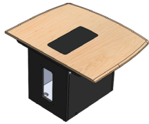
526RR Section 48" W X 37.71" D X 29.13" H