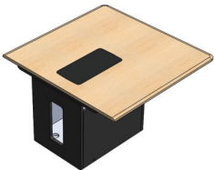
526SE Section 48" W X 46.5" D X 29.13" H