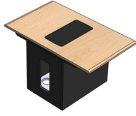
EXT32 Extension (+2 people) 48" W X 29" D X 29.13" H