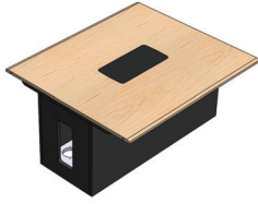
EXT34 Extension (+4 people) 48" W X 55" D X 29.13" H