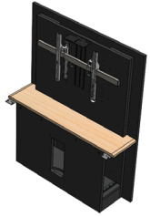
526RW-S/D/XL Section 48" W X 12.6" D X 62" H