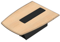
526FR Section 48" W X 67" D X 29.13" H