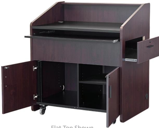
Flat Top Shown

Top rear removable, intended to easily be mounted in a wedge position or as flat large work surface, that can support monitors laptops and room control systems.