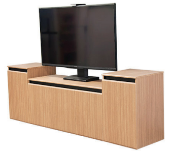
Side by side with CR3000EX (Sold separately) (70" TV shown)