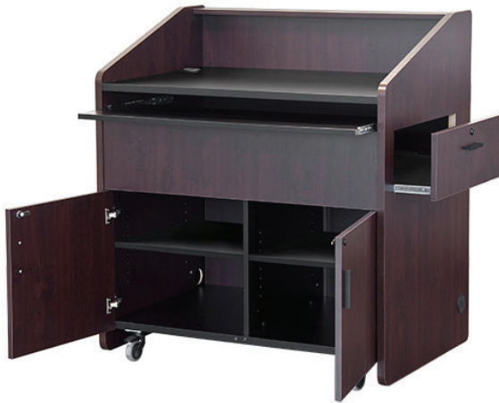
Flat Top Shown

New Feature: Top rear removable, intended to easily be mounted in a wedge position or as flat large work surface, that can support monitors laptops and room control systems.