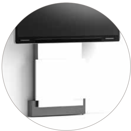
Webex Board Pro 75 Electric Wall Stand White - FPS2WXL/EL/CSP75/GG/VW

Take control of creative, presentation and collaboration work spaces. Salamander's beautiful and highly functional FPS Series Stands offer superior ergonomics complimenting any touch screen display with improved productivity, unrivaled flexibility and lifetime value.