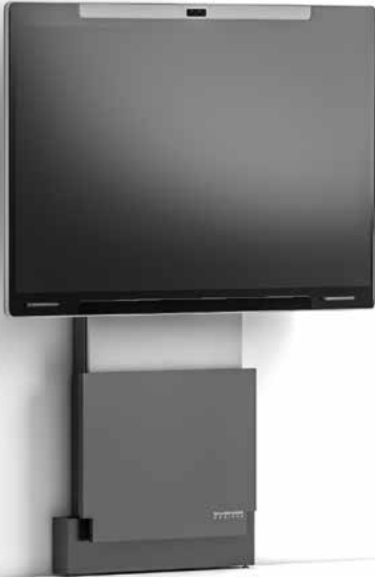
Webex Board Pro 75 Electric Wall Stand Graphite - FPS2WXL/EL/CSP75/GG